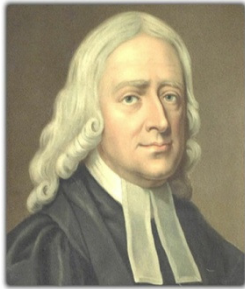
Rev John Wesley

The Manse was named Madeley after a small town in Shropshire where Rev John William Fletcher died in 1785. The Rev John Fletcher was a friend of Rev John Wesley. The Epworth Hall opened in 1888 was named after the birthplace of Rev John Wesley, who was born in 1703.